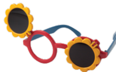
548500 Sunflower Occluding Glasses for smaller faces