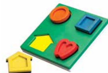
251600 LEA 3-D Puzzle