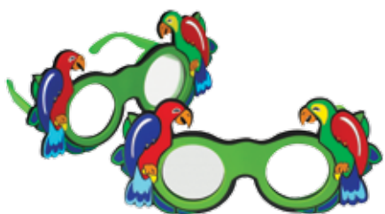
461011 Frosted Parrot Occluding Glasses